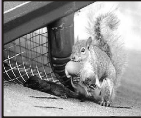
Mother relocating babies

Our wildlife technicians are specially trained to remove squirrels and prevent undue stress or injury to the animals. This is also a practical and economical approach. The inhumane killing, trapping or relocation of squirrels is illegal. Removing mother squirrels leaves the babies to die in your building. The removal of carcasses is time consuming, costly and poses a health risk. Our focus on education and prevention makes us a leader in the wildlife control industry.