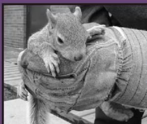
Squirrel baby at 4 weeks