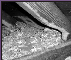
Squirrel nest and chewed roof truss in attic