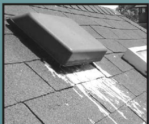
Bird droppings on roof vent