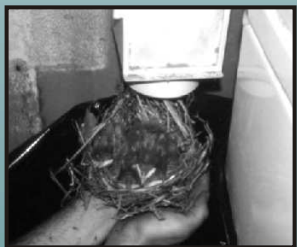
Nest and babies in dryer vent - fire hazard