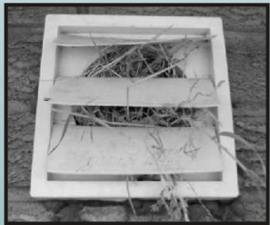
Nesting material in wall vent

Removing breeding birds leaves the babies to die in your building, attracting parasites and causing further health risks. The removal of bird carcasses is a time consuming, costly and unnecessary process. Our focus on education and prevention makes us a leader in the wildlife control industry.