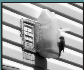
Screening and baby box Note: wall vent screens have 10 year guarantee